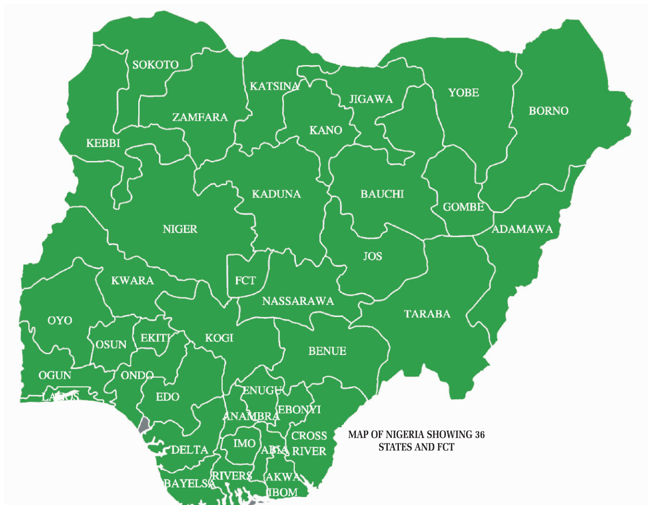
MAP OF NIGERIA SHOWING 36 STATES AND FCT